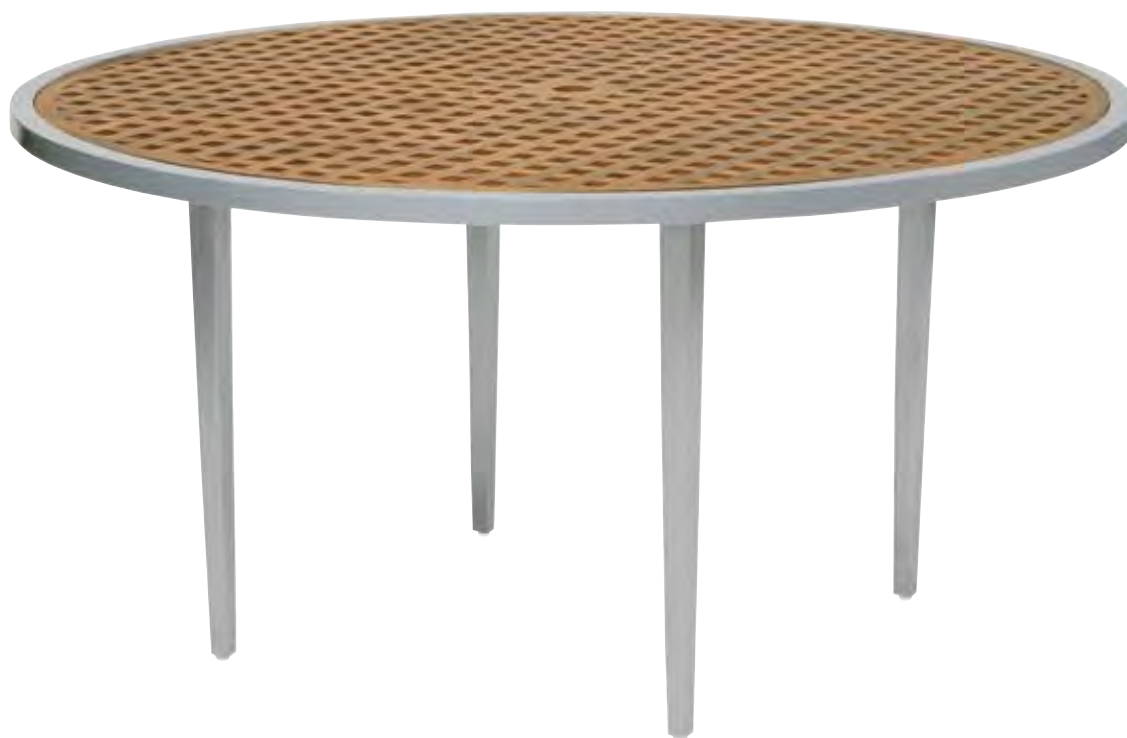
AA-471 ARCHETYPE ROUND DINING TABLE WITH 2½" DIA HOLE FOR UMBRELLA. DIA 55½", H28½". Powder-coated aluminum with teak grid top.