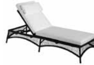
WK-19 Page 11.87