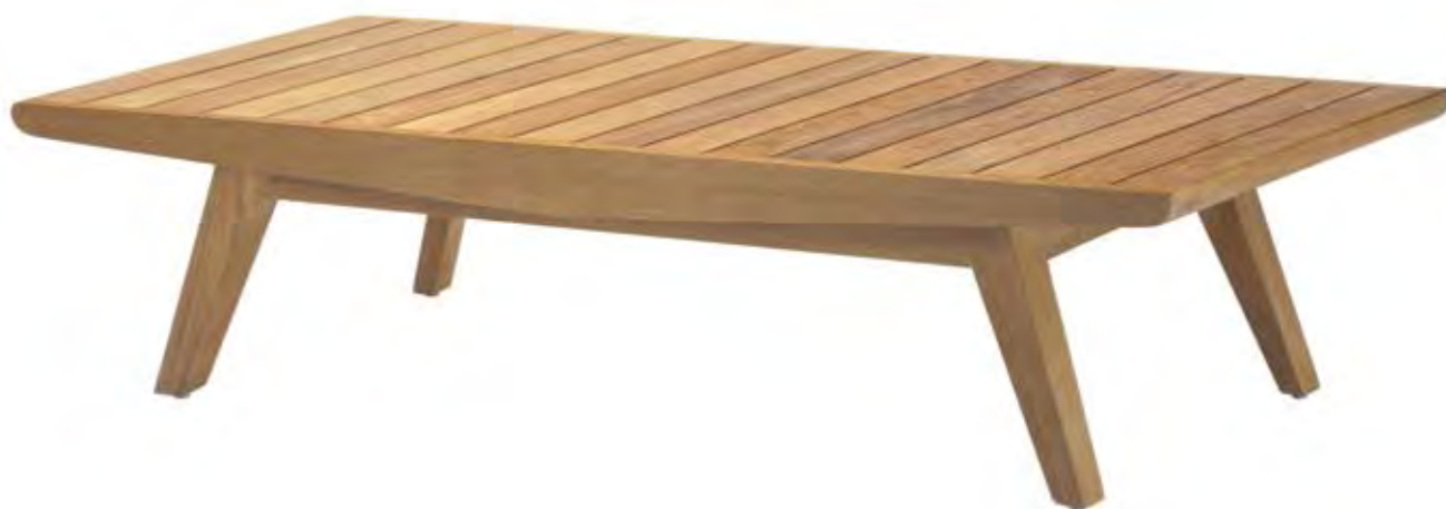
TK-244 AXIAL COCKTAIL TABLE w59", d32", h14". Natural Teak.