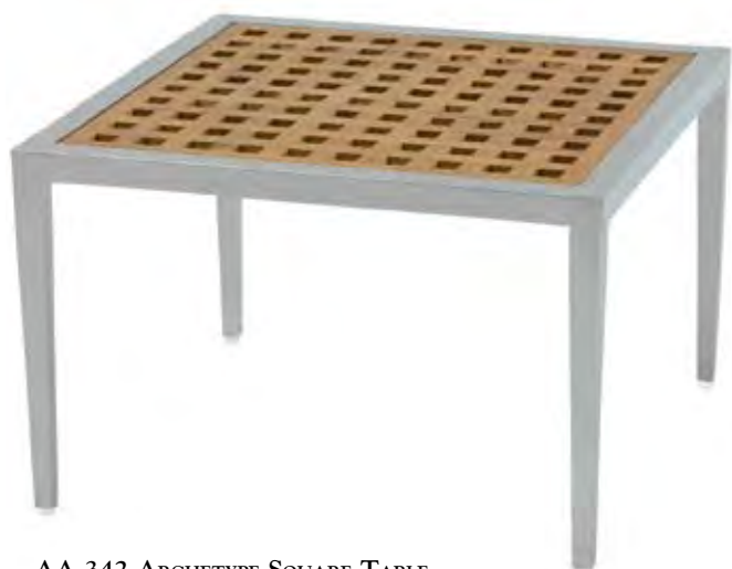
AA-342 ARCHETYPE SQUARE TABLE w23½", d23½", h15". Powder-coated aluminum with teak grid top.