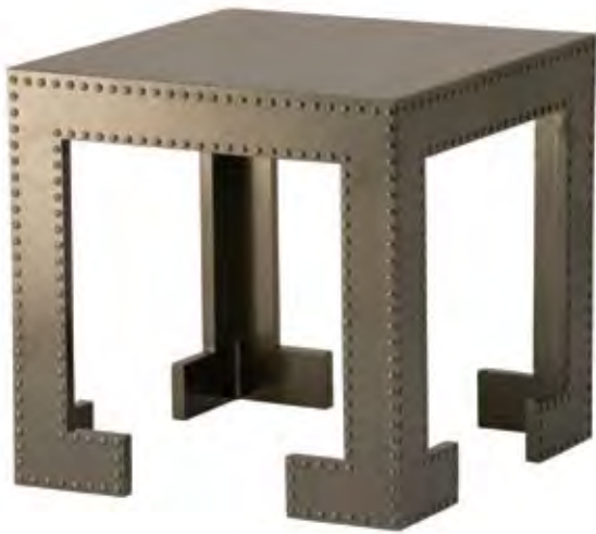
JG-107 CHI CHI SIDE TABLE