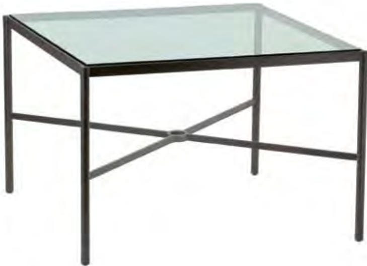
TP-582 SQUARE DINING TABLE w42 \frac{3}{4} ", D42 \frac{3}{4} ", H28 \frac{1}{2} ", Powder coated aluminum frame. Available in Bronze (shown) or Seashell White. \frac{1}{2} " clear tempered glass with optional umbrella hole.