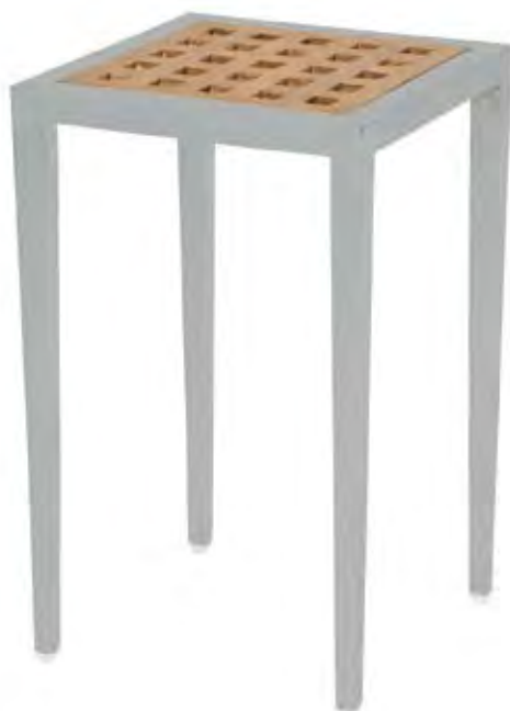
AA-322 ARCHETYPE SPOT TABLE w13½", d13½", h22". Powder-coated aluminum with teak grid top.