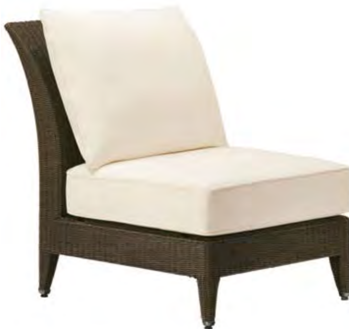
JG-12 SECTIONAL SLIPPER CHAIR w26", d37", h34", sh16", sd21".