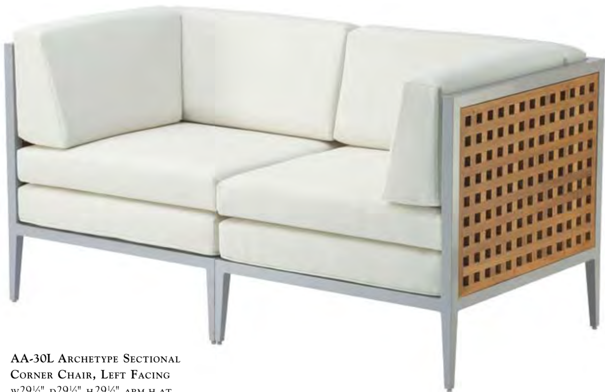
AA-30L ARCHETYPE SECTIONAL CORNER CHAIR, LEFT FACING w29½", d29½", h29½", ARM H AT FRONT 29½", SEAT H17½", SEAT D20¼". Powder-coated aluminum with teak grid back. Drainable foam cushions.