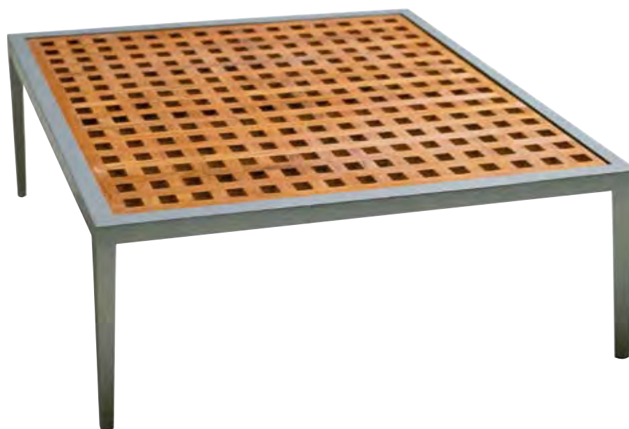
AA-332 ARCHETYPE COCKTAIL TABLE w33½", d33½", h13½". Powder-coated aluminum with teak grid top.