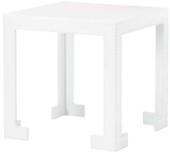
JG-108 CHI CHI "TALL" SIDE TABLE