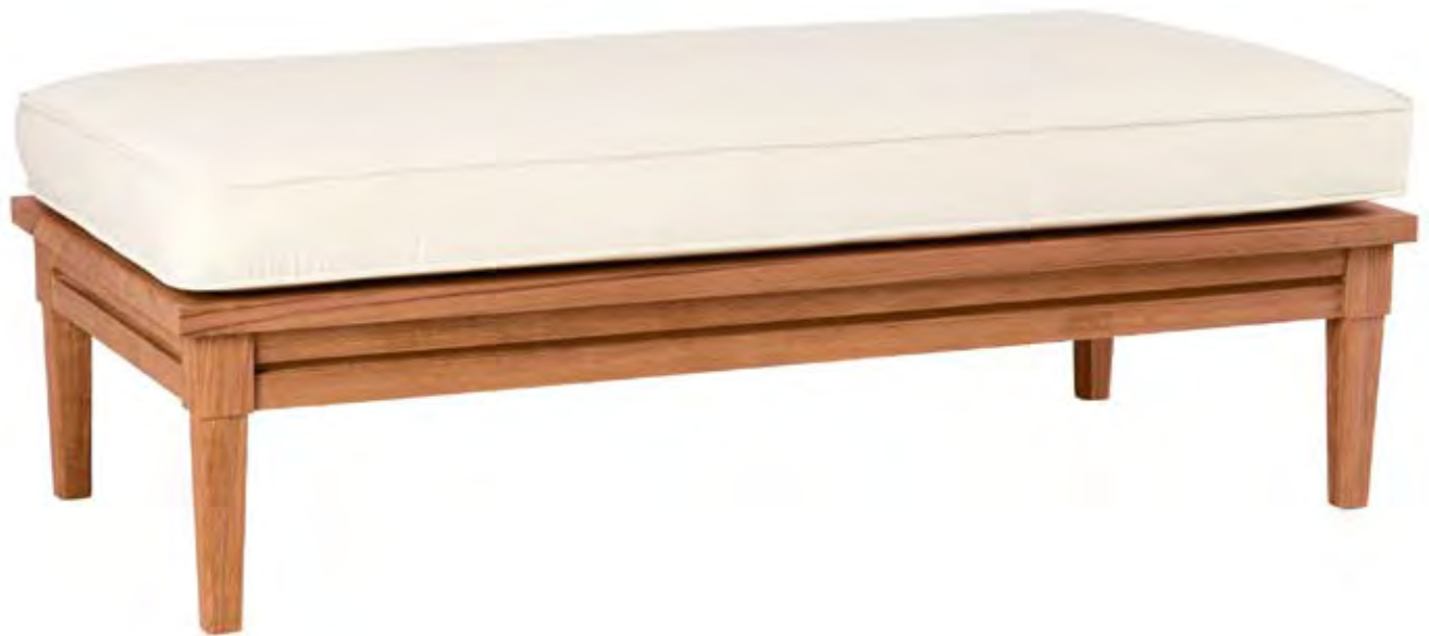
TK-44 PORTICO RECTANGULAR BENCH w59", d28", h14". Natural teak. Shown with optional cushion.