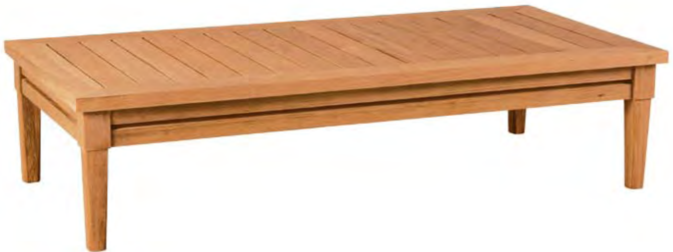
TK-44 PORTICO RECTANGULAR COFFEE TABLE w59", d28", h14". Natural teak.