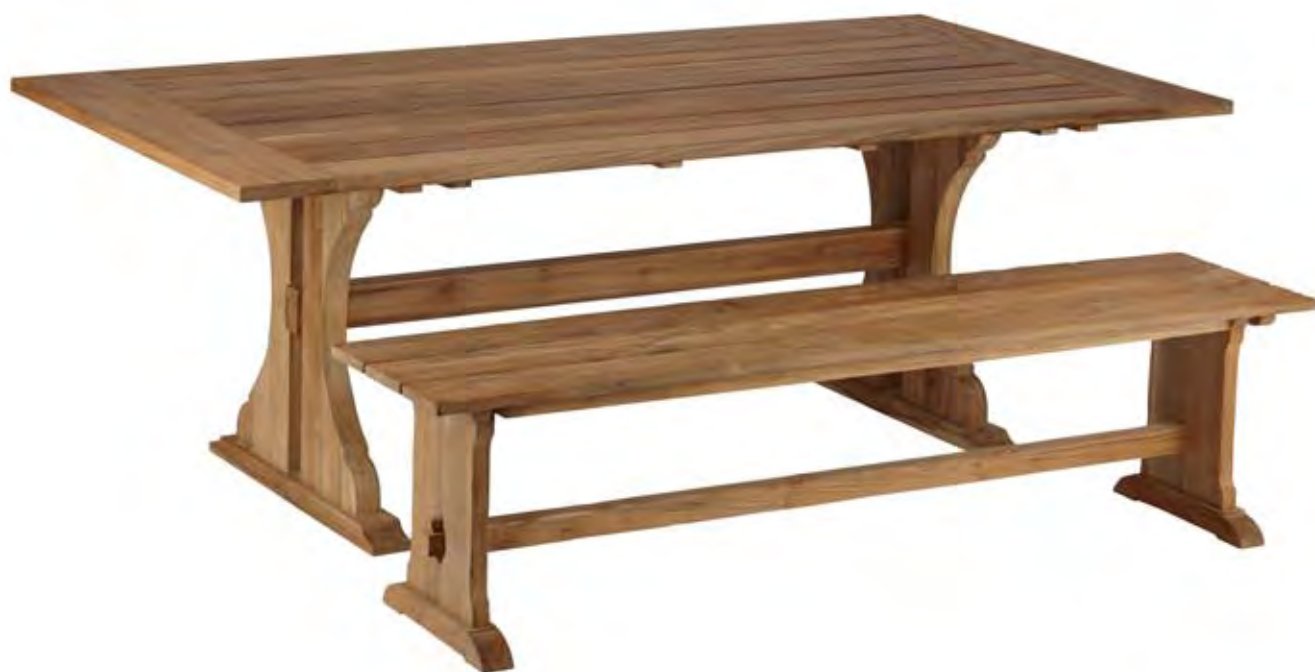
TK-250 RECLAIMED TEAK FARM HOUSE TABLE w84", d41½", h29".