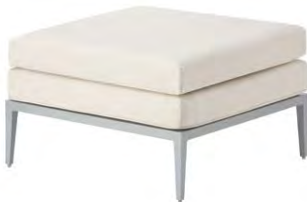
AA-32 ARCHETYPE SECTIONAL OTTOMAN w29½", D29½", H17½", SEAT H17½", SEAT D29½". Powder-coated aluminum. Drainable foam cushions.