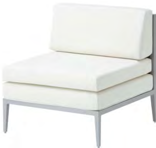
AA-31 ARCHETYPE SECTIONAL SLIPPER CHAIR w29½", D29½", H29½", SEAT H17½", SEAT D20¼". Powder-coated aluminum with teak grid back. Drainable foam cushions.