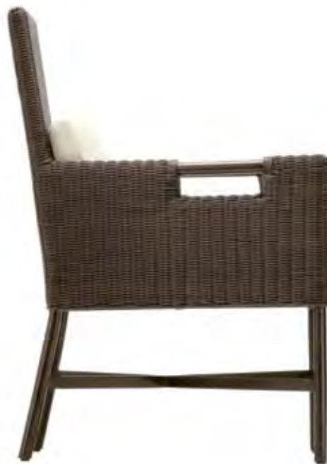
TP-520 DINING ARM CHAIR