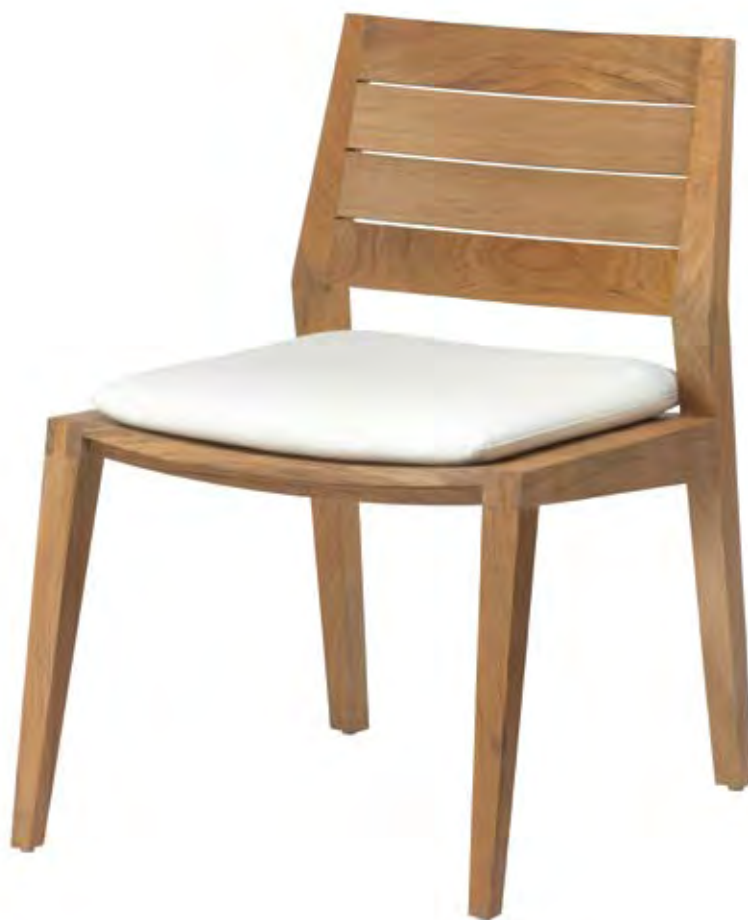
TK-242 AXIAL DINING SIDE CHAIR w22¾", d26½", h33½", SEAT H WITH CUSHION 20", SEAT H WITHOUT CUSHION 18", SEAT D18". Natural teak. Shown with optional seat cushion.