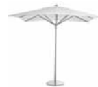
AA-815, AA-816 Page 11.37