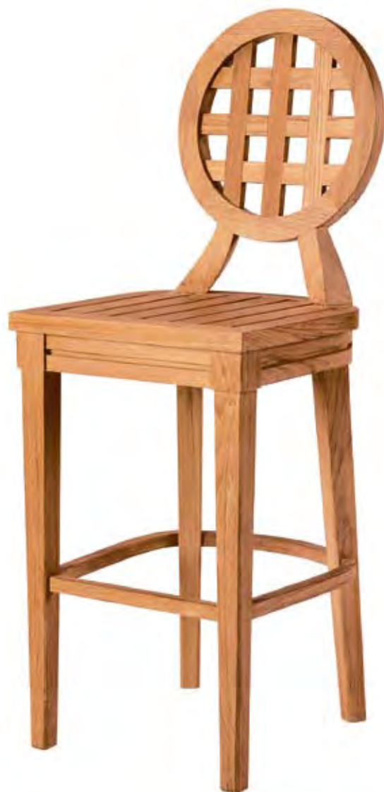
TK-144 PORTICO BAR STOOL w18", d20½", h49½", SEAT H29½", SEAT D16". Natural teak. Shown with optional seat pad. Available in bar height only.