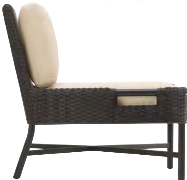
TP-51 SLIPPER CHAIR