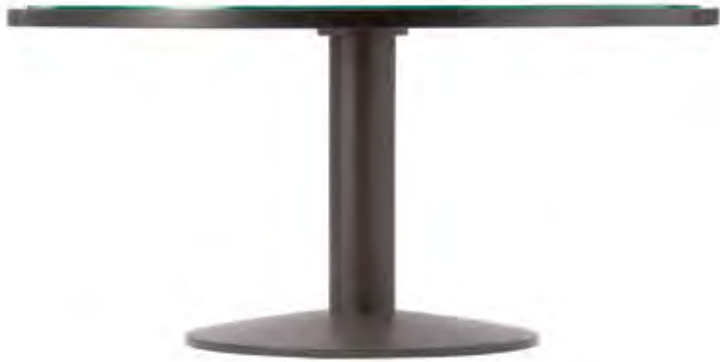
TP-580 PEDESTAL DINING TABLE BASE