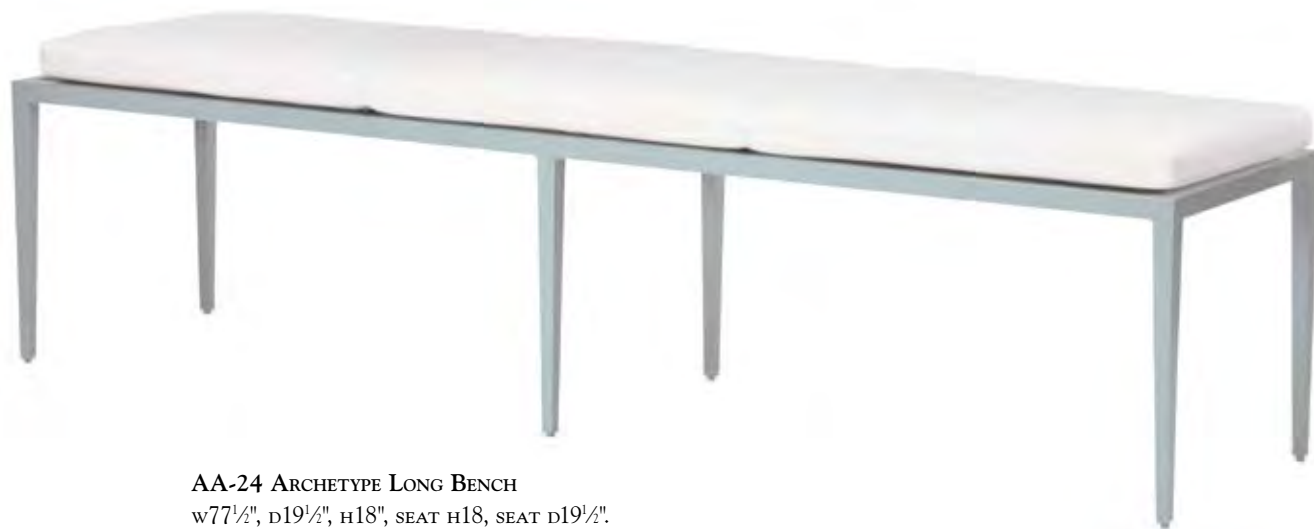
AA-24 ARCHETYPE LONG BENCH w77½", d19½", h18", SEAT H18, SEAT D19½". Powder-coated aluminum with teak grid seat and back. Drainable foam cushion.