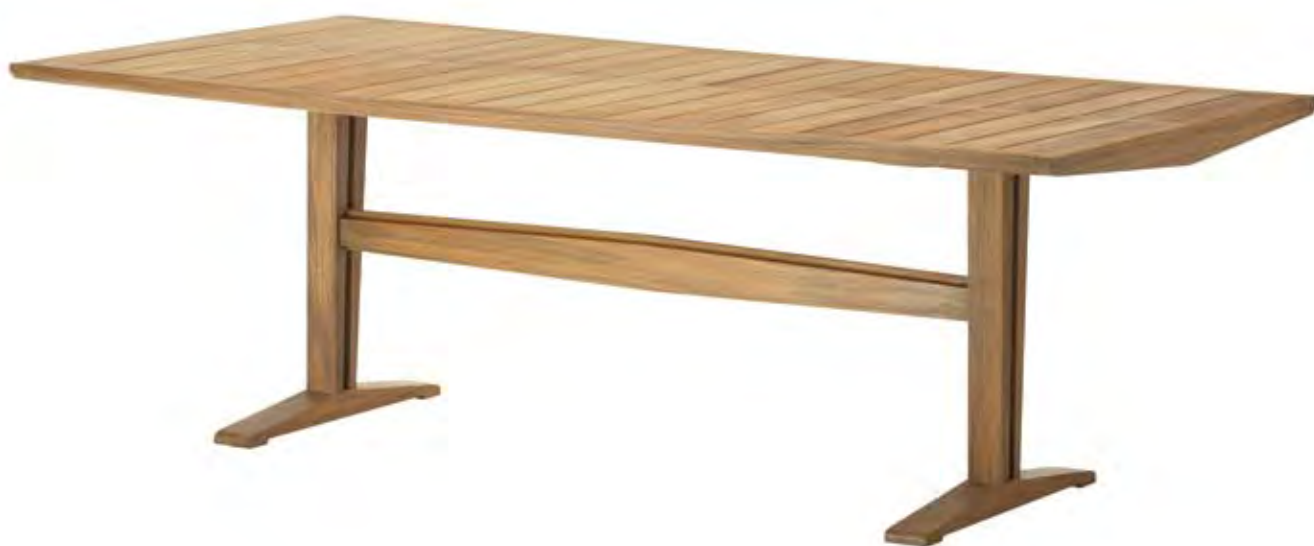
TK-248 AXIAL TRESTLE DINING TABLE w85¼", d42", h28½". Natural teak.