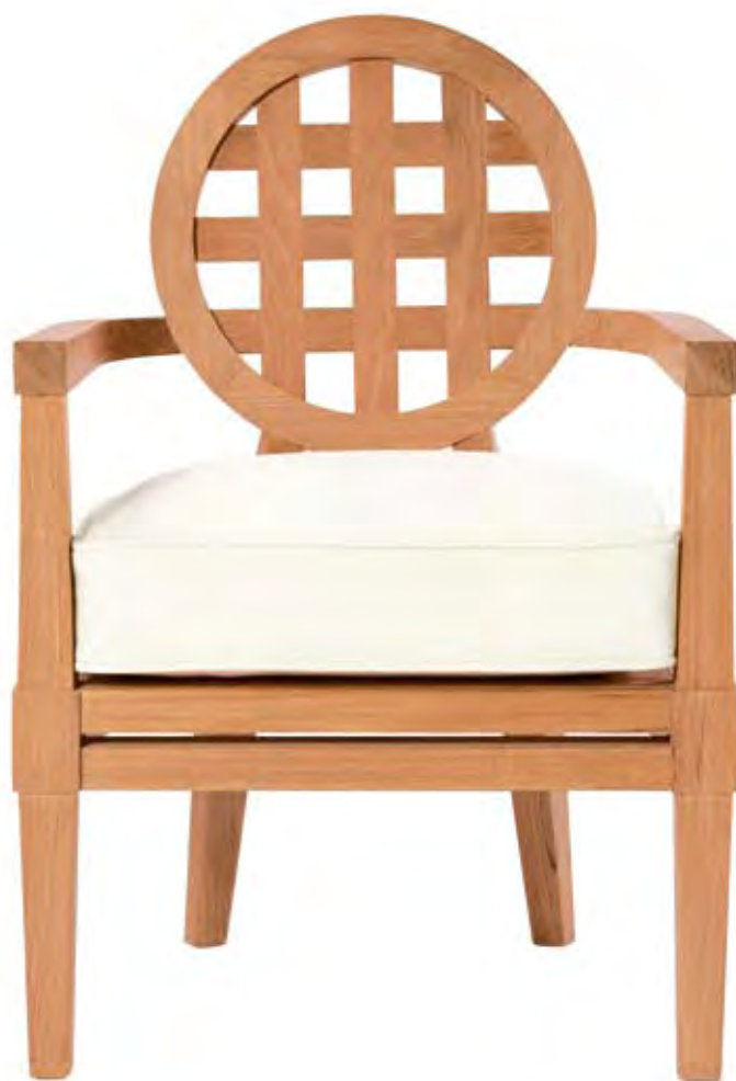
TK-143 PORTICO DINING ARM CHAIR w25", d24½", h38", ARM H AT FRONT 26", SEAT H19", SEAT D19". Natural teak. Shown with optional seat cushion.