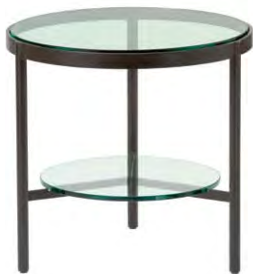
TP-525 ROUND SIDE TABLE DIA24", H23". Powder coated aluminum frame. Available in Bronze (shown) or Seashell White. ½" clear tempered glass.