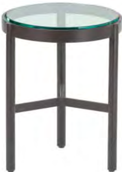
TP-522 SPOT TABLE DIA14", H18". Powder coated aluminum frame. Available in Bronze (shown) or Seashell White. ½" clear tempered glass.