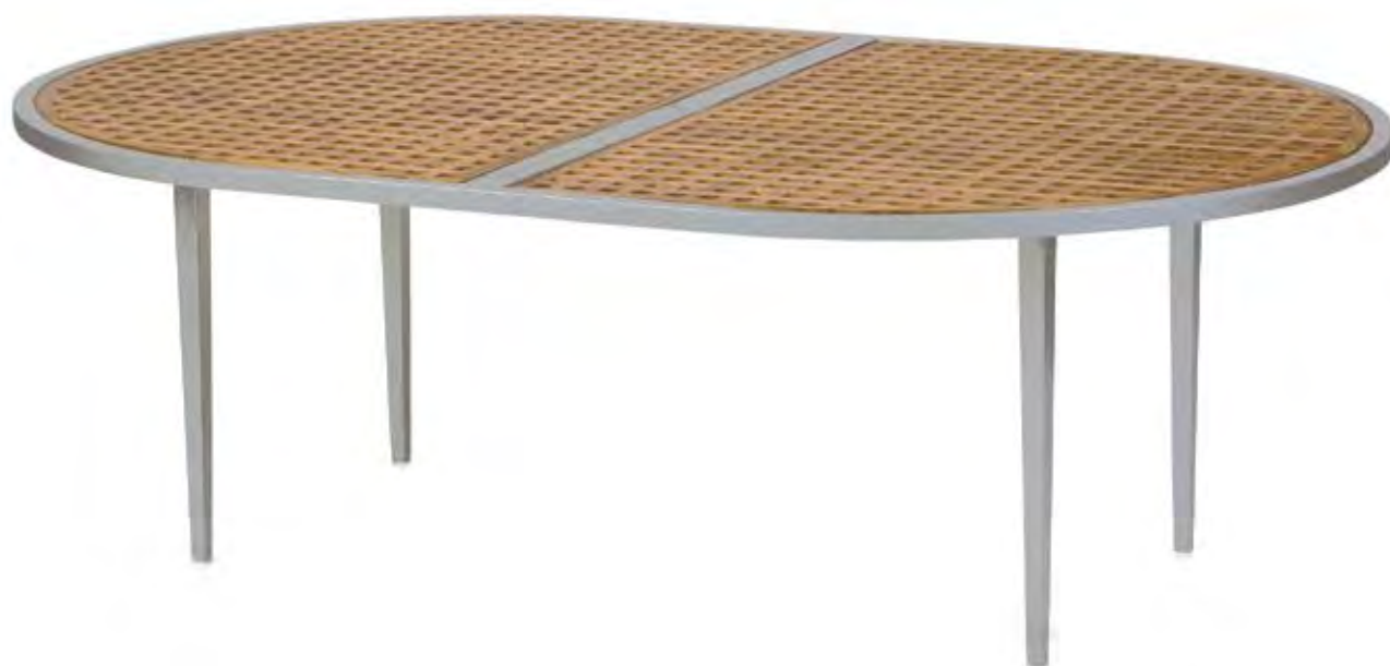
AA-473 ARCHETYPE OVAL DINING TABLE WITH 2½" DIA HOLE FOR UMBRELLA. W53½", D83", H28½". Powder-coated aluminum with teak grid top.