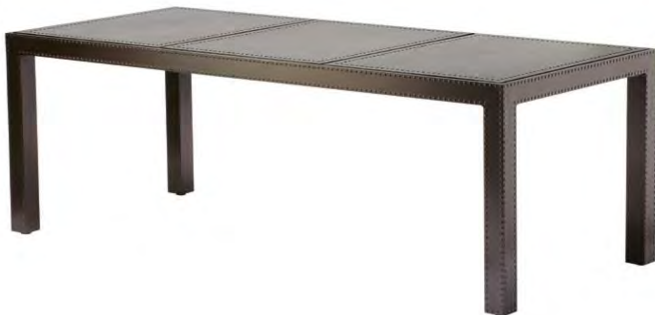
JG-106 CHI CHI DINING TABLE Shown with powder-coated aluminum inserts.