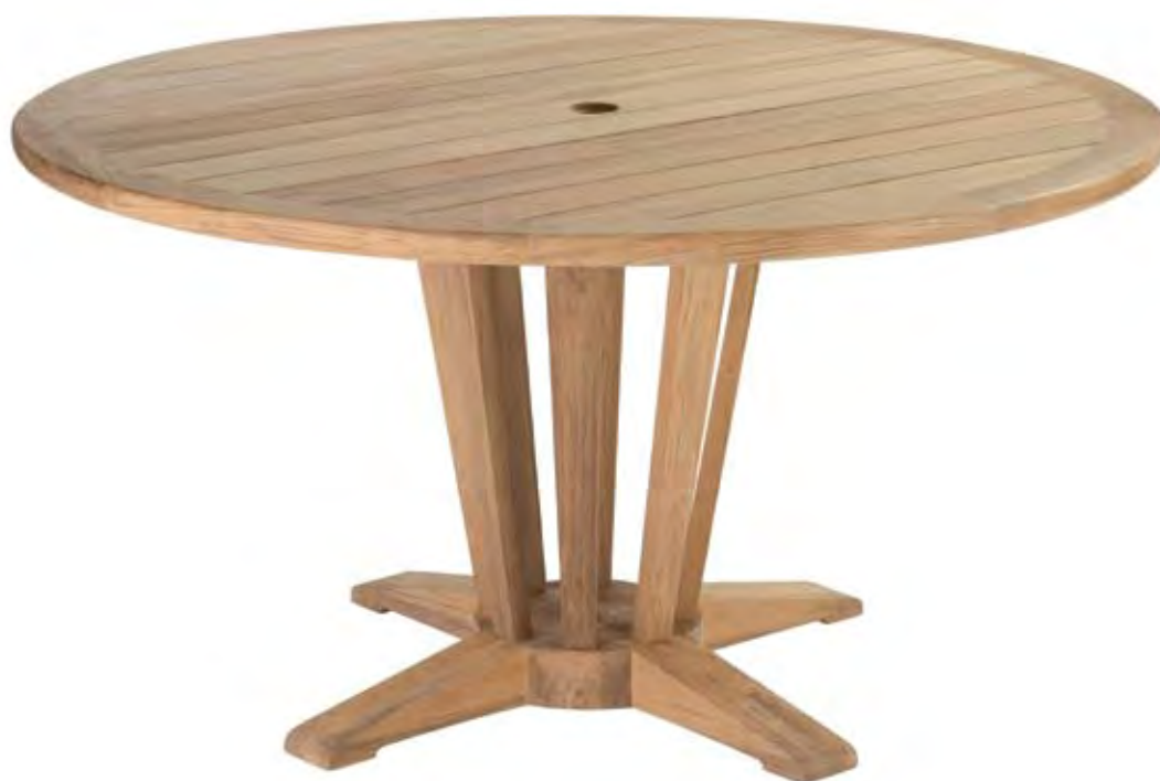
TK-247 AXIAL PEDESTAL DINING TABLE DIA 54", H 28½" Natural teak with 2¼ (6 cm) dia. umbrella hole.