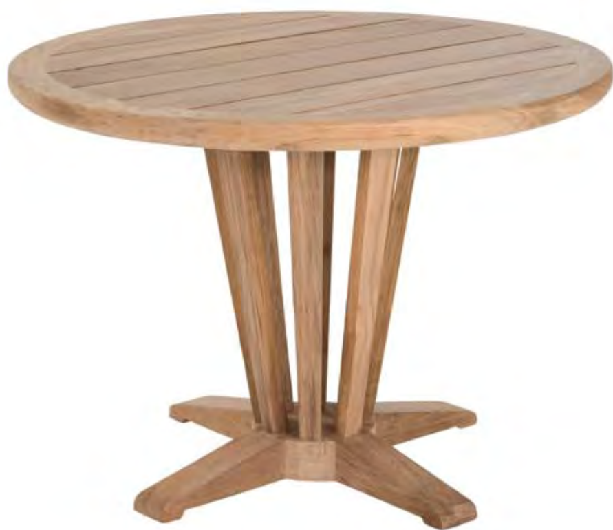
TK-246 AXIAL SPOT TABLE DIA 25", H 18" Natural Teak.