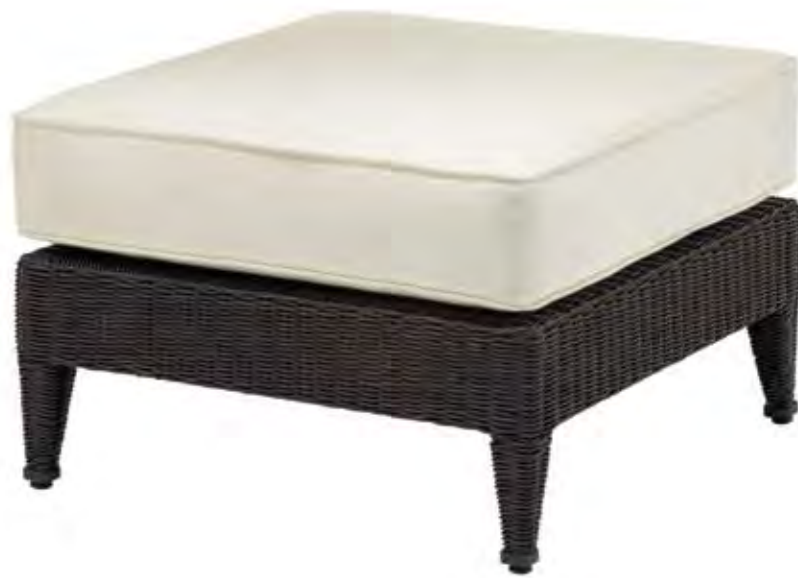
JG-13 SECTIONAL OTTOMAN w26", d26", h16", sh16", sd26".