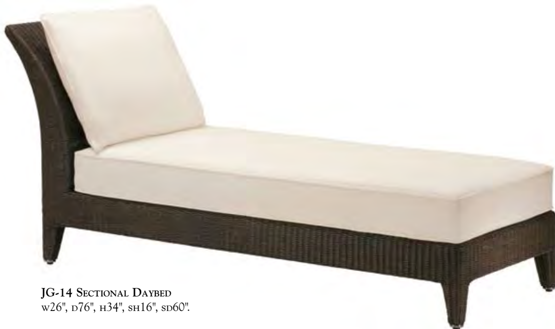
JG-14 SECTIONAL DAYBED w26", d76", h34", sh16", sd60".