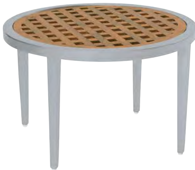
AA-351 ARCHETYPE ROUND TABLE DIA 23½", h15". Powder-coated aluminum with teak grid top.