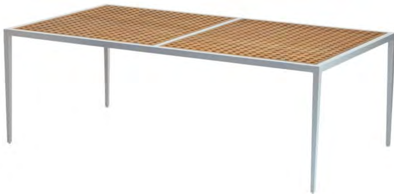
AA-344 ARCHETYPE LONG DINING TABLE Powder-coated aluminum with teak grid top. w82½", d46", h28½".