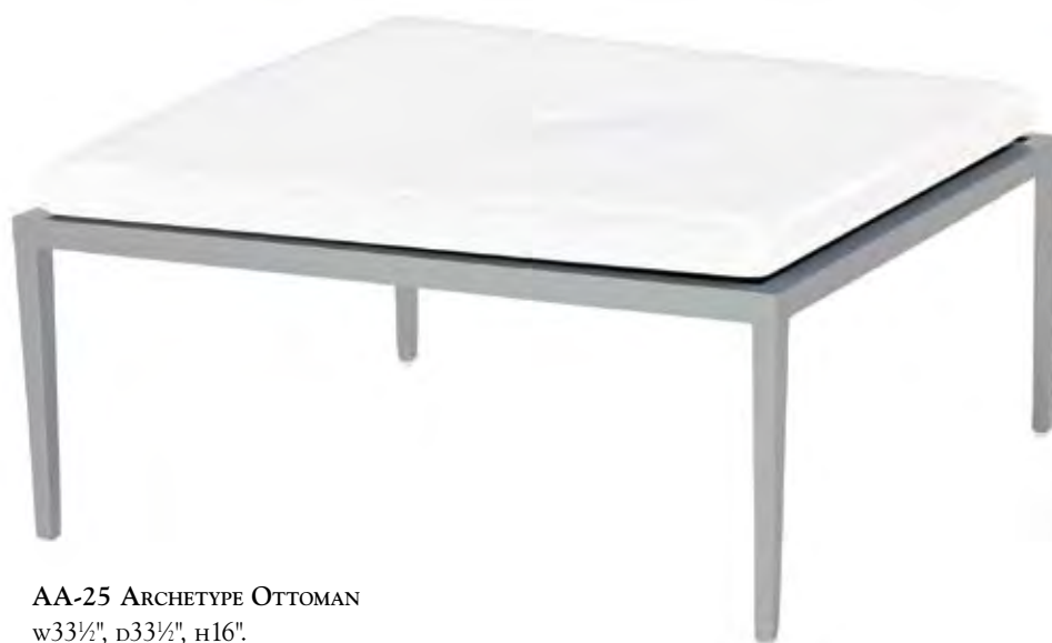
AA-25 ARCHETYPE OTTOMAN w33½", d33½", h16". Powder-coated aluminum with teak grid top. Drainable foam cushion.