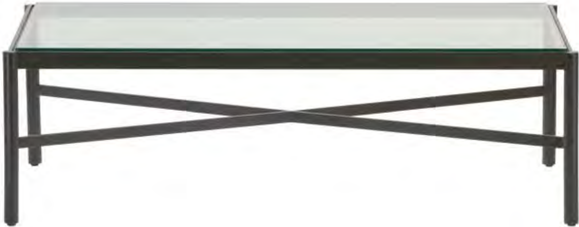
TP-532 COCKTAIL TABLE